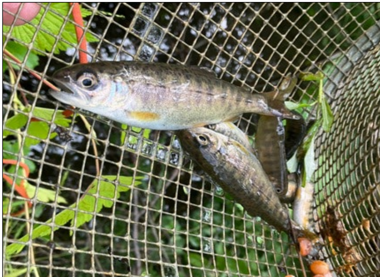
Figure 1.–Juvenile coho salmon caught at waypoint 591.