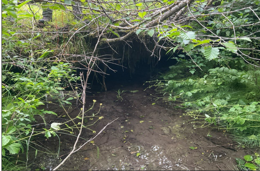
Figure 2.—Upstream of bridge , looking downstream.