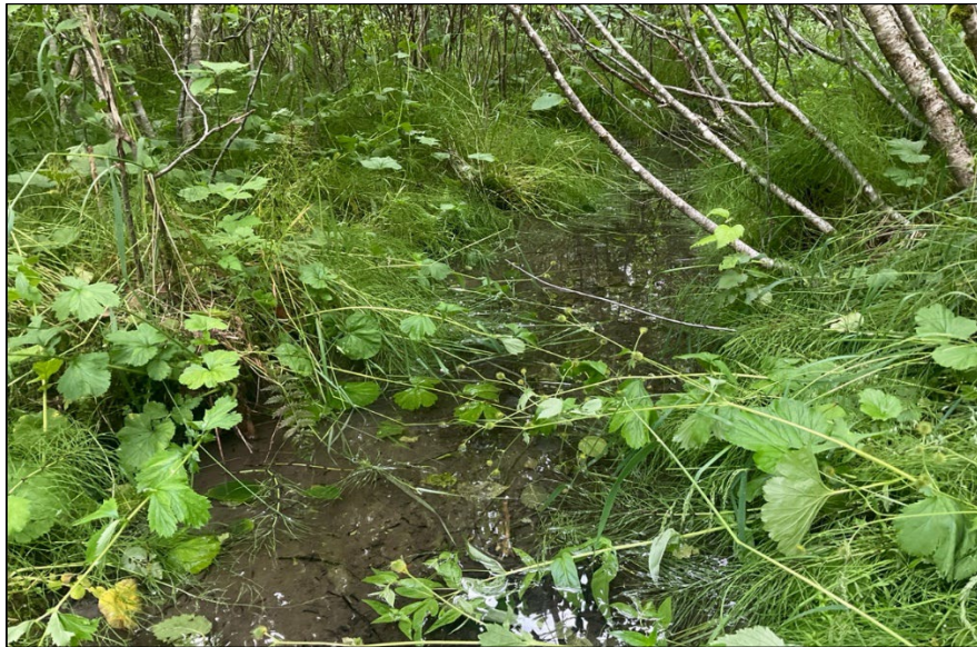
Figure 3.—Channel downstream of bridge.